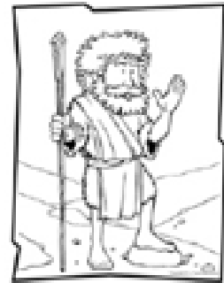
JOHN THE BAPTIST

Each number represents a letter of the alphabet. Substitute the correct letter for the numbers to reveal the coded words.