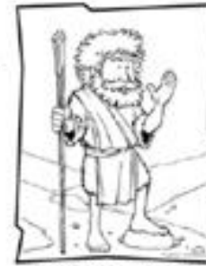
JOHN THE BAPTIST